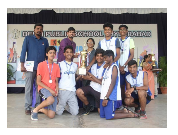
Basketball Boys Runners-up – Chirec PS