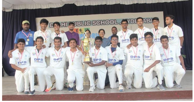
Cricket Winners – DPS Hyderabad