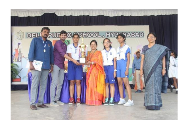
Basketball Girls Runners-up – Chirec PS