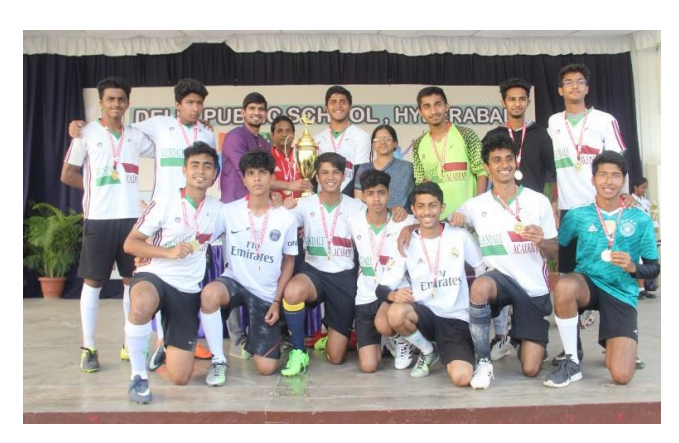
Football Winners – Glendale Academy